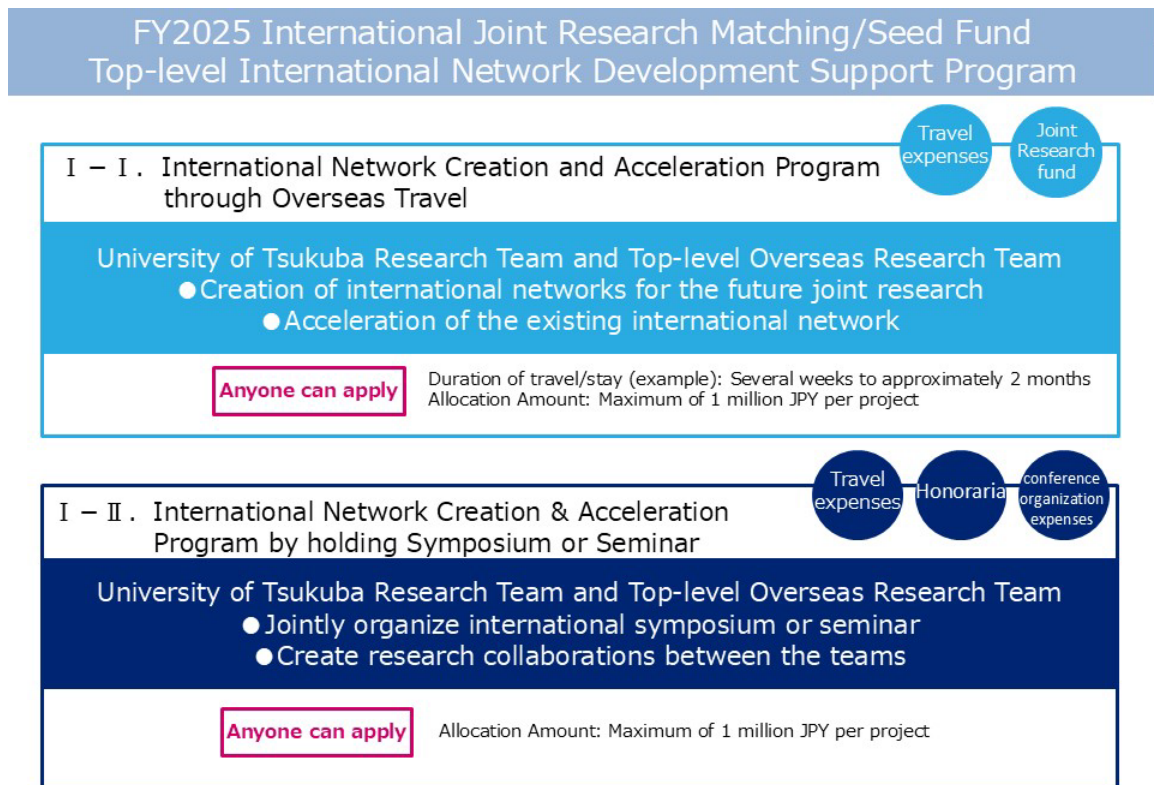
Figure 2 Support Program for International Network Development with Top-level Overseas Research Teams